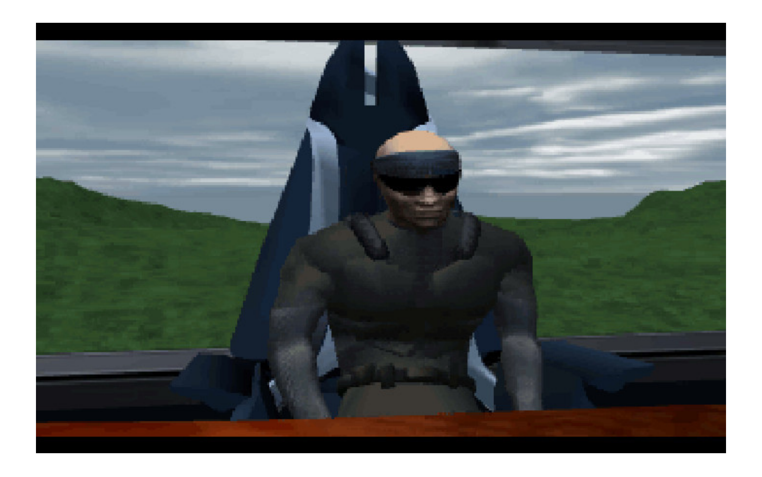
Cyberia 2: Resurrection Activation Code Generator

Download ->>> <a href="http://bit.ly/2NFfnQn">http://bit.ly/2NFfnQn</a>